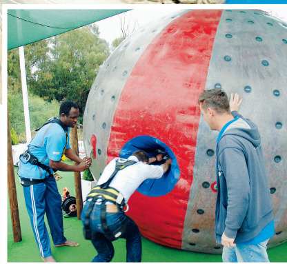
INTO THE VOID: Sphering, while (top left) paintballing and (above) bridgejumping

SPECIAL DISCOUNTS FOR OLIVE PRESS READERS quote olive in the coupon code field or when calling us