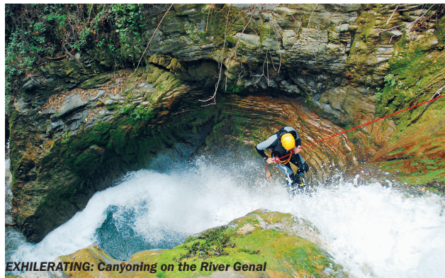
EXHILARATING: Canyoning on the River Genal